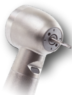
Legacy 5 Standard Head with 4 Port Spray