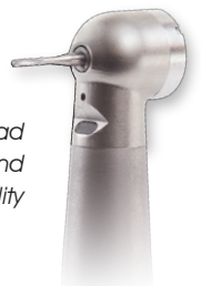
Legacy 5 Mini Head For Excellent Visibility and Accessibility