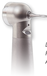
Legacy 5 Mini Head For Excellent Visibility and Accessibility