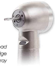
Legacy 5 Standard Head For Crown and Bridge With 4 Port spray

Mobile: 1-530-717-3145 www.laresdental.com